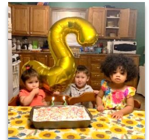
Celebrating with Friends