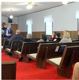
Preaching in Illinois